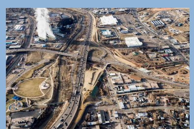
March 2016 Aerial Project Photo