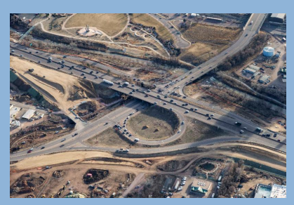
<u>CLICK HERE</u> to view additional aerial photos.