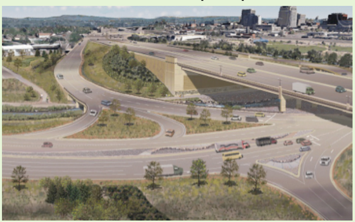
Illustration of New I-25 Southbound Off-Ramp

In early May the traveling public will no longer utilize the existing southbound I-25 loop ramp to exit on to Cimarron Street/US 24. Instead, motorists will exit to the north of Cimarron Street/US 24, about a quarter mile south of the Bijou exit. The existing loop ramp has been in place for the past 56 years, so this will be an adjustment for everyone who frequents this area.